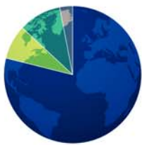
PES SALES BY REGION