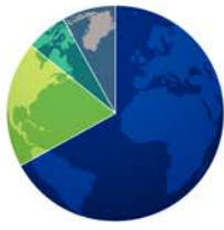
IPS SALES BY REGION