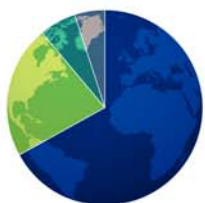
AMC SALES BY REGION