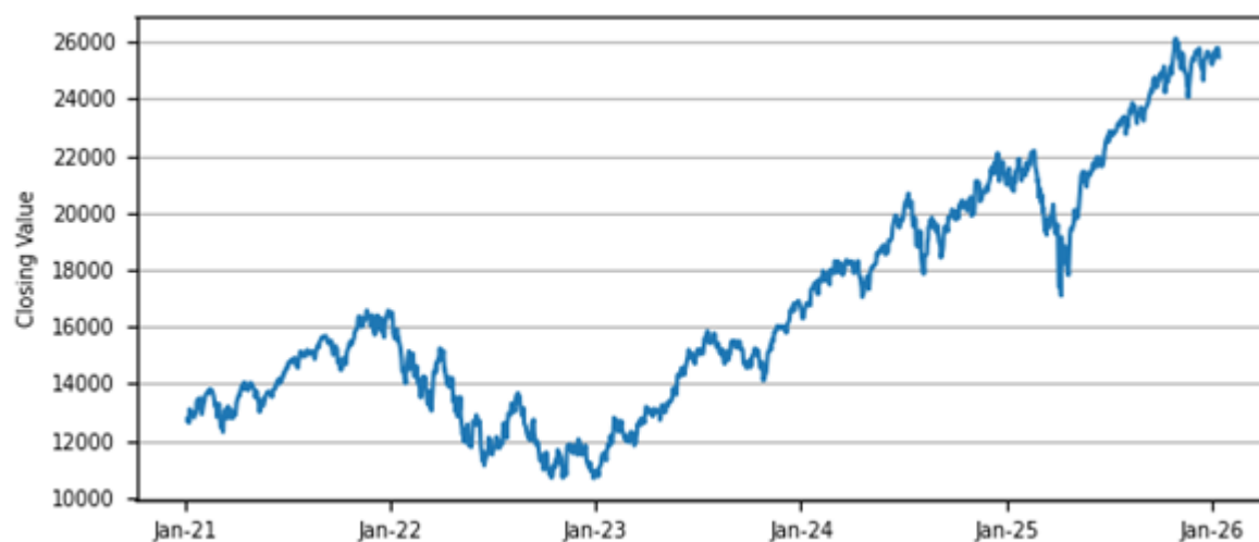
Historical Performance of the NDX

The historical levels of the NDX should not be taken as an indication of future performance, and no assurance can be given as to the closing level of the NDX on any coupon observation date, including the determination date.