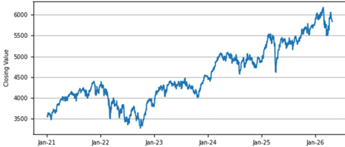
Historical Performance of the SX5E

The historical values of the SX5E should not be taken as an indication of future performance, and no assurance can be given as to the closing value of the SX5E on any coupon observation date, including the final valuation date.