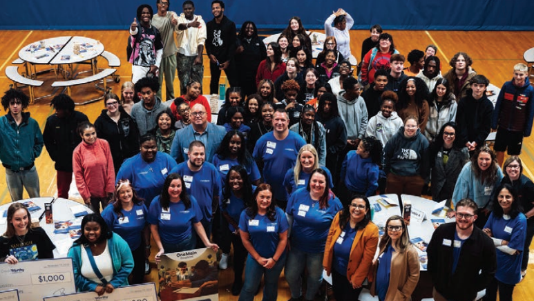
Credit Worthy by OneMain Financial event with students at Clark Montessori High School in Cincinnati, OH