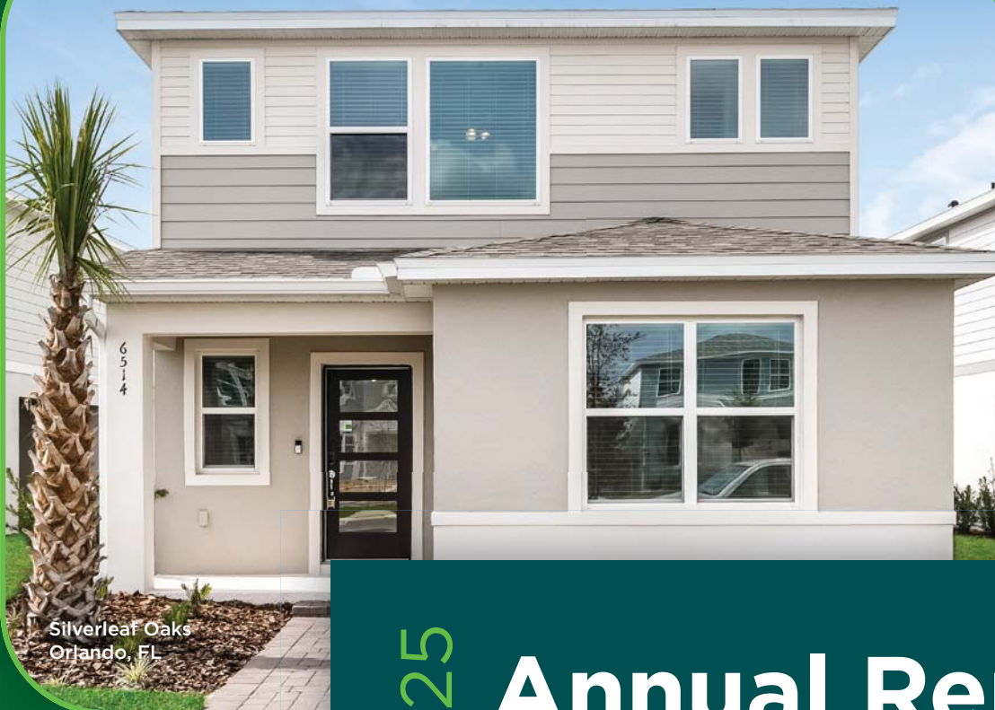
Silverleaf Oaks Orlando, FL